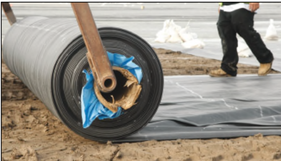
Each EPDM panel seam was prepared with a primer and allowed to flash off before putting down Firestone QuickSeam™ Tape and rolling it out to ensure a watertight seam. Pipe boots were also installed, where necessary, and a batten strip was mechanically attached around a piece of equipment that sits on the reservoir floor to measure water depth. A skid steer was outfitted with a spreader bar and the geotextile fabric was unrolled by hand and unfolded in slightly overlapping sections down the 3:1 slopes. As each section was finished, another crew followed with the EPDM panels using the same system for unrolling the 50-foot by 200-foot panels.

Although an attempt was made to repair the clay liner by bringing in new clay and repacking it, the reservoir still would not hold water.