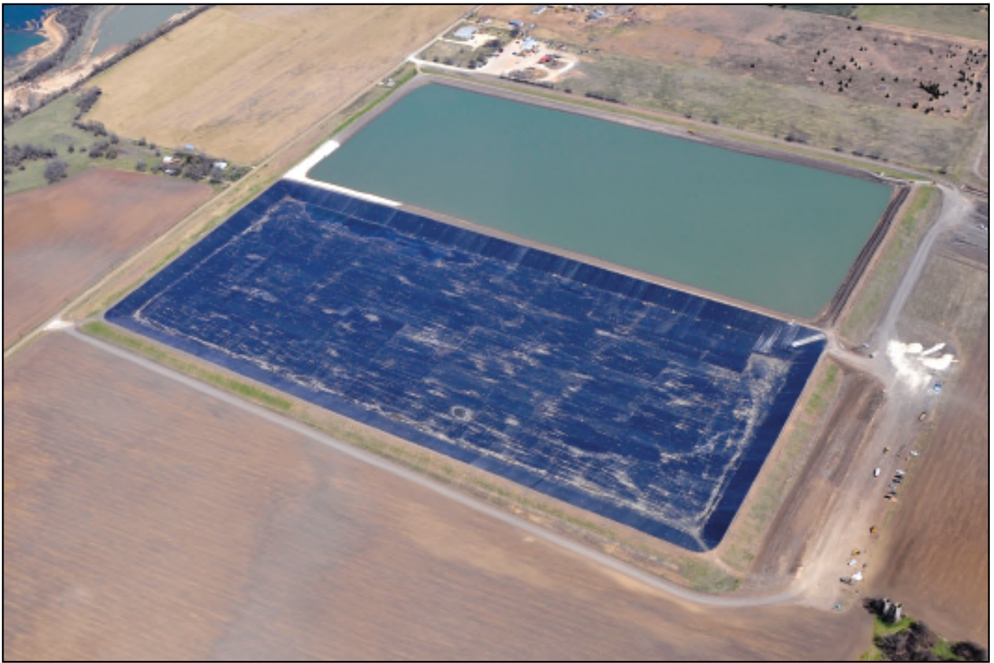
An unexpected, yet welcomed, result of the project is that the city of Robinson has been able to cut costs by reducing chemicals used to treat the water at the plant.