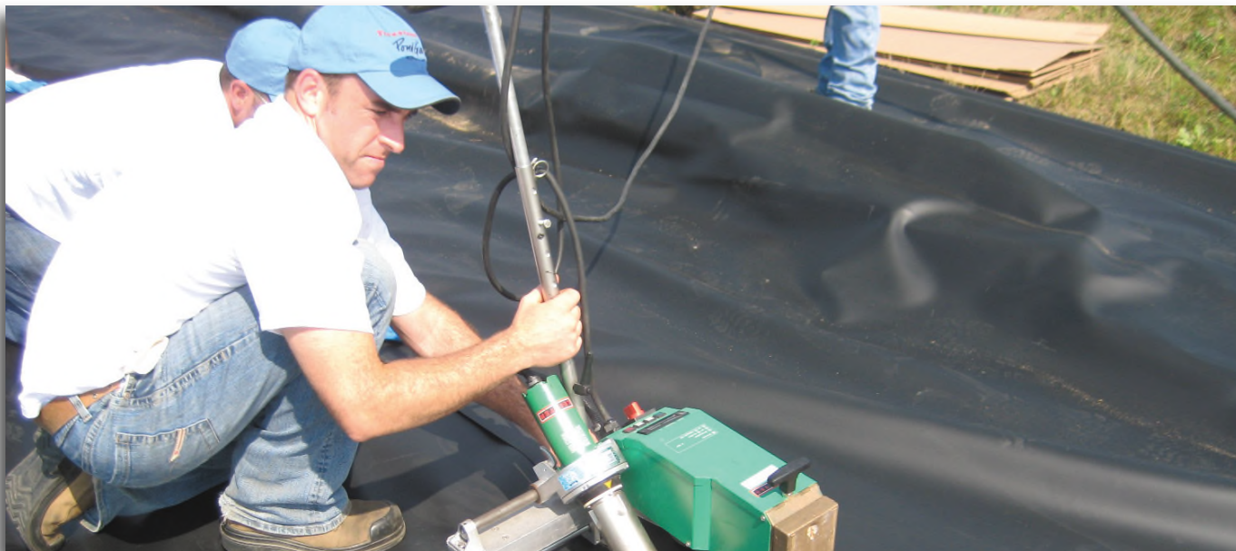
A robot welder was used to heat-weld two panels together.

A s the size of Québec's hog industry has exploded over the past 25 years, so has the number of waste containment tanks used to store manure for subsequent use as fertilizer. Census statistics estimate that there are upwards of 6,000 of these tanks in the province.